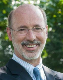
TOM WOLF for Governor

Running for re-election, Tom has battled a Republican majority in both the PA House and Senate for adequate funding for education, social services, infrastructure and fair elections. He fully restored the $1 billion cut to education made under the Corbett administration. He was at the forefront in the battle to secure a fair congressional map for Pennsylvania and will fight to end gerrymandering. He will continue to stand up to Donald Trump's attempts to gut Medicaid, increase premiums, charge seniors an age tax, and strip coverage from people with pre-existing conditions. He is committed to commonsense gun safety reform, criminal justice reform and 21 st century voting reforms. He supports a permanent ban on hydraulic fracturing in the Delaware River Basin. Governor Wolf signed a bill that legalized medical marijuana. He secured funding for 45 drug treatment centers. He is Pennsylvania's last defense against steep cuts to vital programs and turning back the clock on women's reproductive rights. https://www.wolfforpa.com/