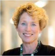
CHRISSE HOULAHAN for US House 6 th District

Chrissy earned her engineering degree from Stanford with a ROTC scholarship and an M.S. in Technology and Policy from MIT. She served three years active duty as a Captain in the US Air Force and 13 years in the Reserve. As COO of AND1 Basketball, it grew from a start-up to a major apparel company. She co-founded B-Lab (a nonprofit that promotes B Corporations and good business practices). She joined Teach for America, earning an M.S. in Education and teaching chemistry at Simon Gratz H.S. in Philadelphia. She went on to form Springboard Collaborative (a nonprofit focused on improving early childhood literacy in underserved communities). She has been endorsed by PA AFL-CIO, VoteVets.org, Emily's List, Sierra Club and others. As your member of Congress, she will work to expand access to affordable healthcare, quality education, and programs that improve the economic security for Pennsylvania families. www.chrissyhoulahanforcongress.com