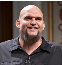
JOHN FETTERMAN for Lt. Governor

John is a native Pennsylvanian and the mayor of Braddock, PA since 2005. He led the revitalization of this economically depressed town in the Pittsburgh suburbs. Applying what he'd learned as an AmeriCorps volunteer and from Harvard's Kennedy School of Government, he focused on finding solutions that have turned Braddock into a growing, thriving community. Mayor John officiated one of the first same-sex marriages in the commonwealth. In 2016, he decided to run for U.S. Senate to represent the struggling towns all over Pennsylvania that have gotten a raw deal. He shocked the establishment by earning 20% of the vote in a 4-way race and winning Allegheny County, the 2nd-largest in the state. John emerged as one of Pennsylvania's leading progressive voices for working people, running on issues like inequality, racial justice, and ending the failed war on drugs. He is committed to building a stronger PA, so that every child born here has an equal shot, regardless of zip code. https://johnfetterman.com